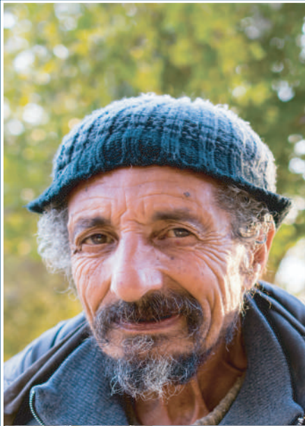
Envelopes are on the pews at both Churches